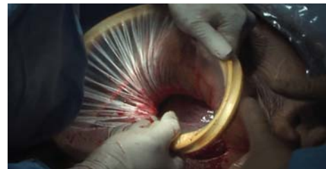
6. Repeat 2-3 times until desired exposure is achieved.