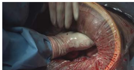
8. To remove, reach inside the abdomen.