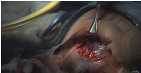
1. Collapse the lower blue ring.