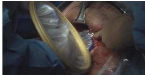
2. Insert it into the abdomen (first towards the head, then towards the feet).