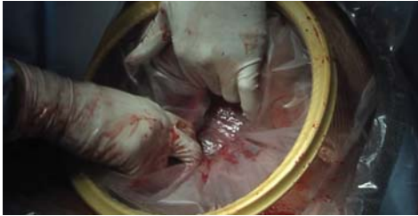
3. Gently pull the yellow ring to ensure insertion and perform a quick digital exam to check for trapped tissue.