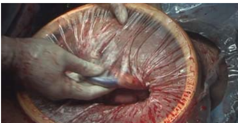
9. Grasp the lower blue ring and pull outwards.