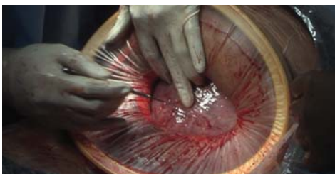
7. Perform procedure.