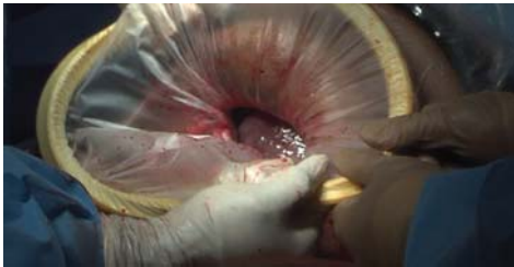
5. Roll the ring outwards and down as if scooping. If desired, an assistant can hold the rolled ring while physician slides fingers down the ring and completes the roll.