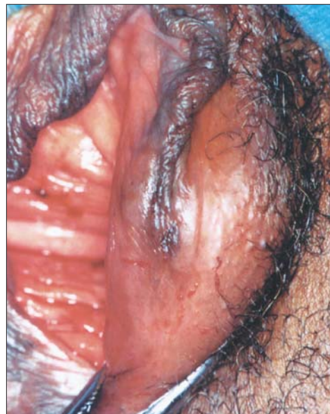
FIGURE 2. Bartholin's gland abscess.

Information from references 4, 11, and 12.