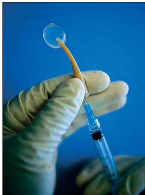
FIGURE 3. Inflated Word catheter.

tively quick and easy procedure that provides almost immediate relief to the patient, this approach should be discouraged because there is a tendency for the cyst or abscess to recur. 1,5,16 One investigator 17 reported a 13 percent failure rate for the procedure. Furthermore, incision and drainage may make later Word catheter placement or marsupialization difficult. 1,16